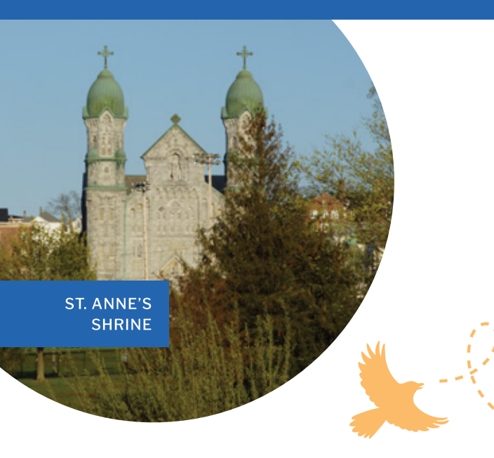
Soar across Fall River with me...